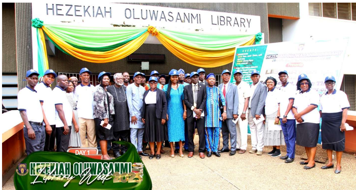
UNIVERSITY LIBRARIAN WITH THE PRINCIPAL OFFICERS OF THE UNIVERSITY AND OTHER PARTICIPANTS AT THE EXHIBITION OPENING ON TUESDAY, APRIL 22, 2025

On Day 1 (April 22nd, 2025) , the library dazzled with an exhibition and an Awareness Dance. The exhibition, titled "Obafemi Awolowo University Memoirs," showcased cherished items and information, invoking a sense of nostalgia about the University's rich history and the evolution of the Hezekiah Oluwasanmi Library. Following the Exhibition Opening, Library staff, together with the University Librarian, joyfully danced and sang motivational songs, creating awareness throughout the Obafemi Awolowo University community.