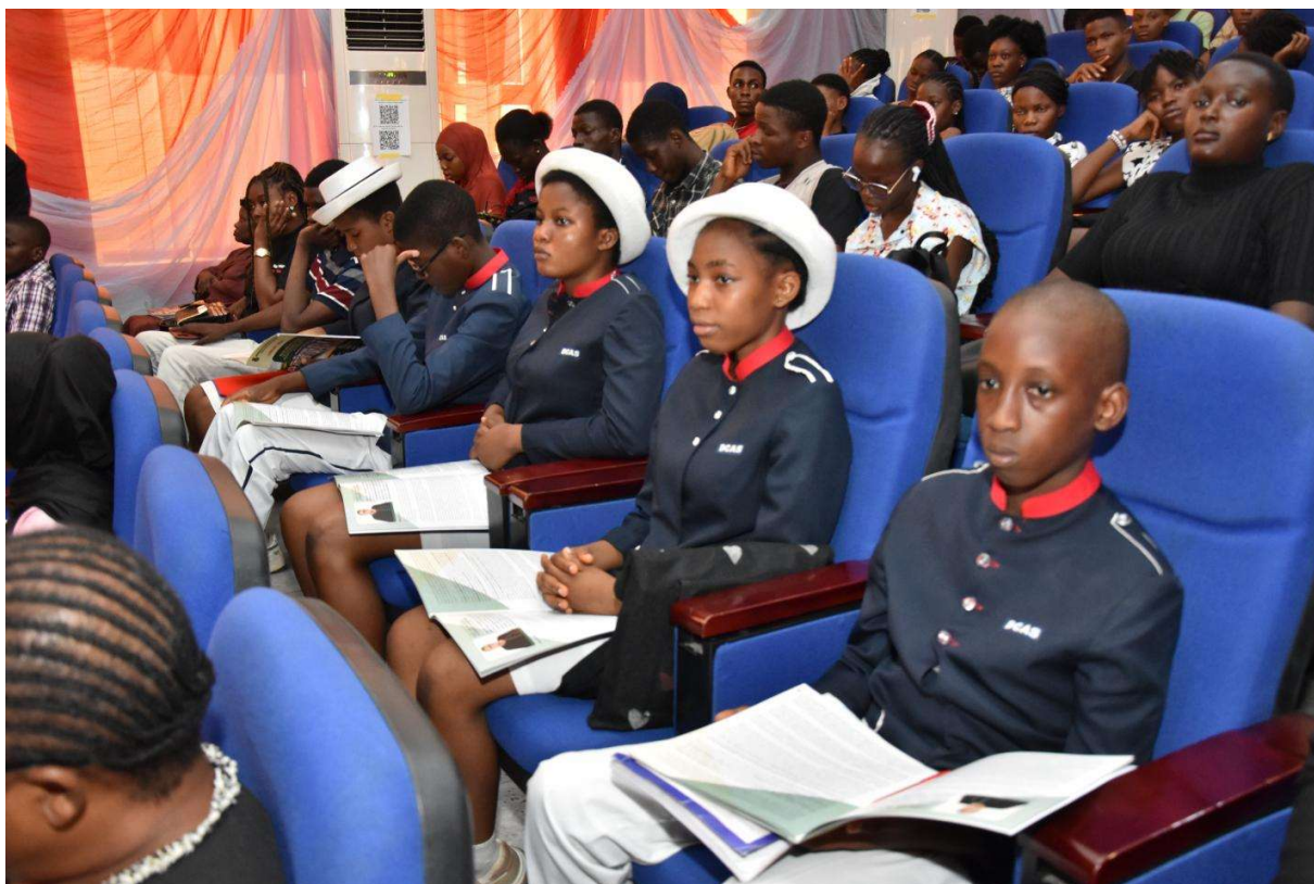
INVITED SECONDARY SCHOOL STUDENTS AT THE VENUE OF THE PUBLIC LECTURE ON WEDNESDAY, APRIL 23, 2025