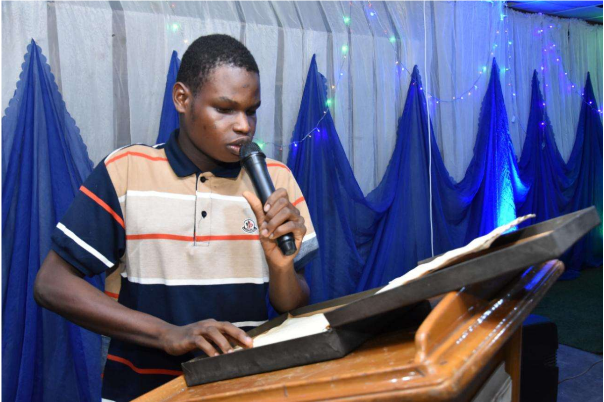
A VISUALLY IMPAIRED STUDENT READING FROM THE BRAILLE DURING THE NIGHT OF READINGS ON THURSDAY, APRIL 24, 2025