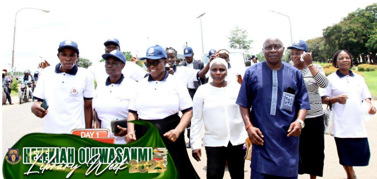
AWARENESS DANCE LED BY THE UNIVERSITY LIBRARIAN ON TUESDAY, 22 APRIL 2025