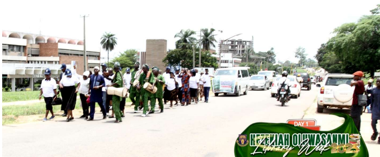
HEZEKIAH OLUWASANMI LIBRARY STAFF DURING THE AWARENESS DANCE PARADE AROUND THE UNIVERSITY CAMPUS ON TUESDAY, 22 APRIL 2025