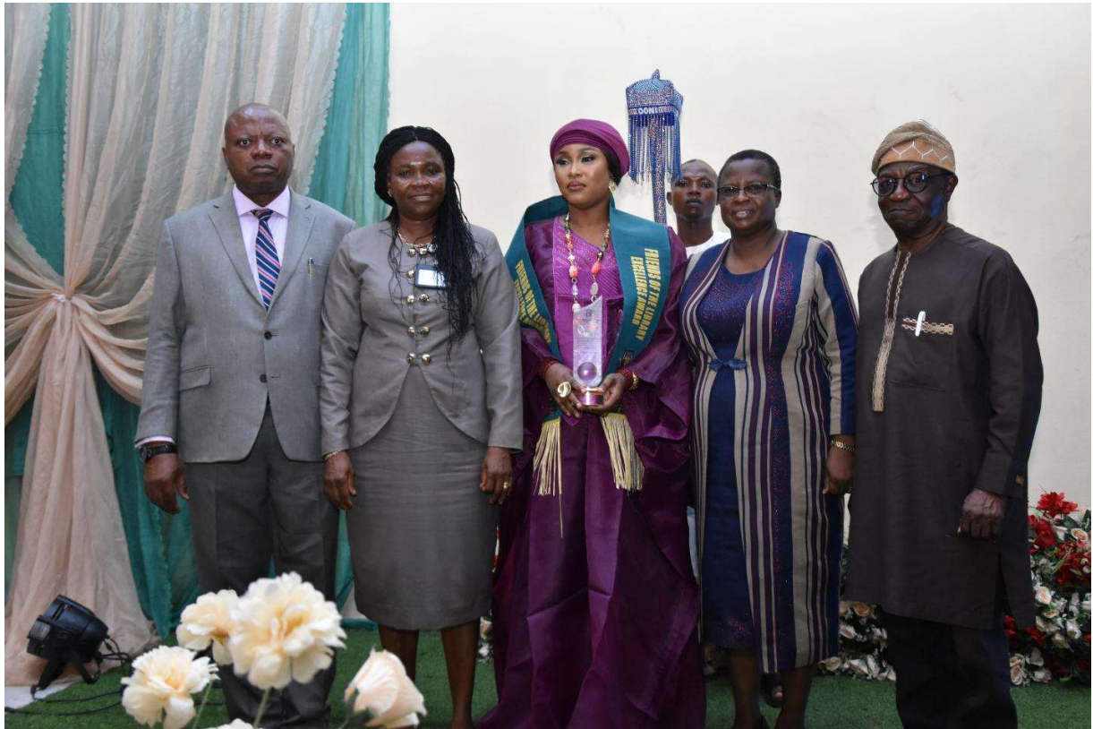
CONFERMENT OF AWARD OF EXCELLENCE GIVEN TO HER REGAL MAJESTY AMBASSADOR OLORI TEMITOPE ENITAN OGUNWUSI - COLLECTED BY HER REPRESENTATIVE DURING THE PUBLIC LECTURE ON WEDNESDAY, APRIL 23 rd , 2025