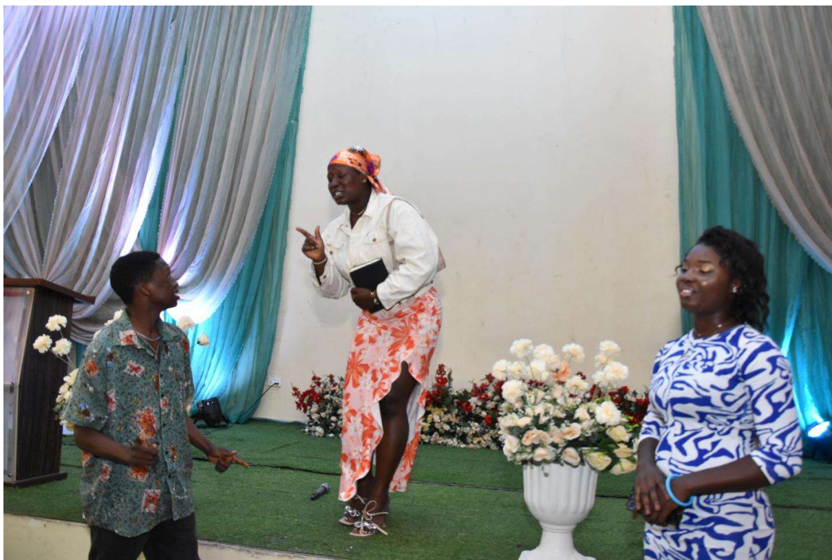
A SHORT CLIP OF THE PLAYLET TITLED BOOKED FOR SUCCESS BY OBAFEMI AWOLOWO UNIVERSITY STUDENTS AT THE PUBLIC LECTURE ON WEDNESDAY, APRIL 23 rd , 2025

The day's events climaxed with the cutting of the Library Week cake: